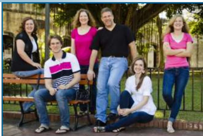
All material © 2013 by Kirk A. Jones

% AGWM, Acct. # 2254795 1445 Boonville Springfield, MO 65802-1894