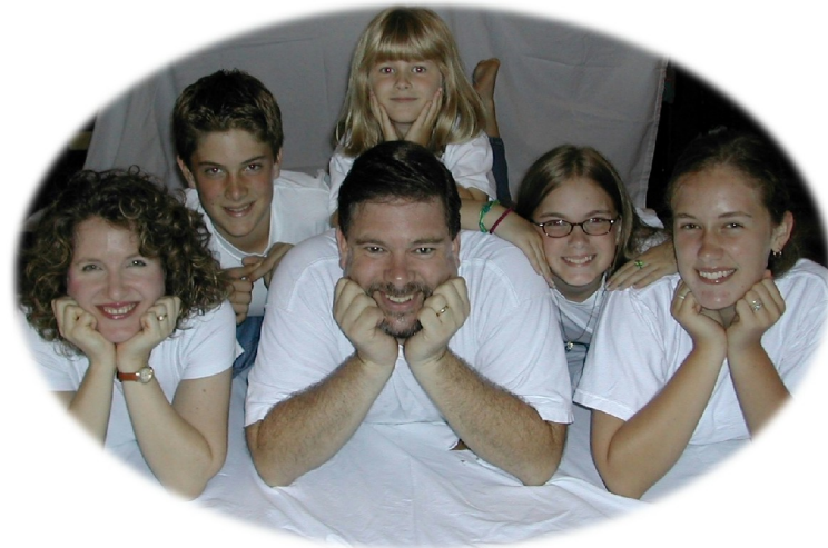
All material © 2006 by Kirk A. Jones

% AGWM, Acct # 2254795 1445 Boonville Springfield, MO 65802-1894