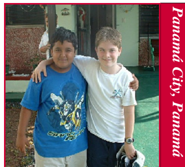
Panamá City, Panamá