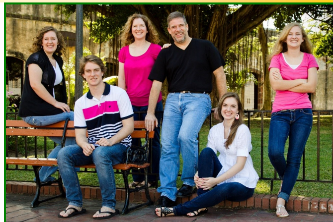
All material © 2014 by Kirk A. Jones

% AGWM, Acct. # 2254795 1445 Boonville Springfield, MO 65802-1894