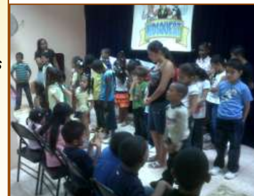
North Carolina AIM team