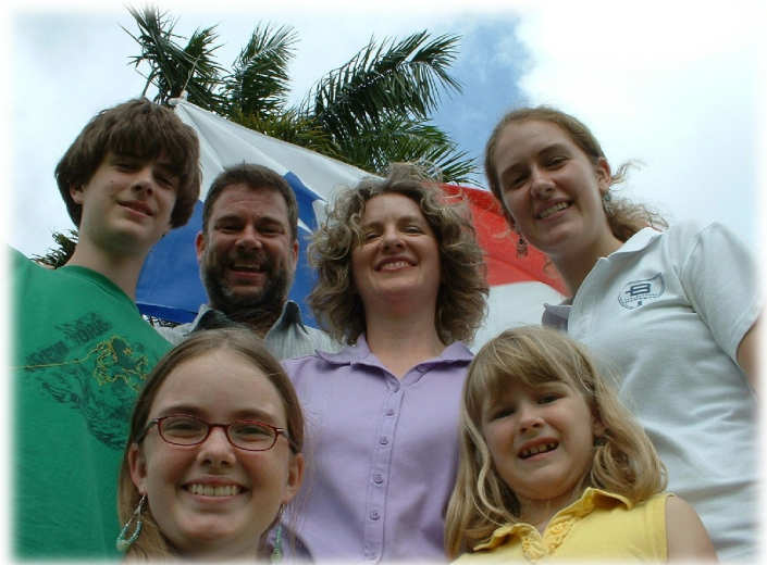
All material © 2005 by Kirk A. Jones

% AGWM, Acct # 2254795 1445 Boonville Springfield, MO 65802-1894